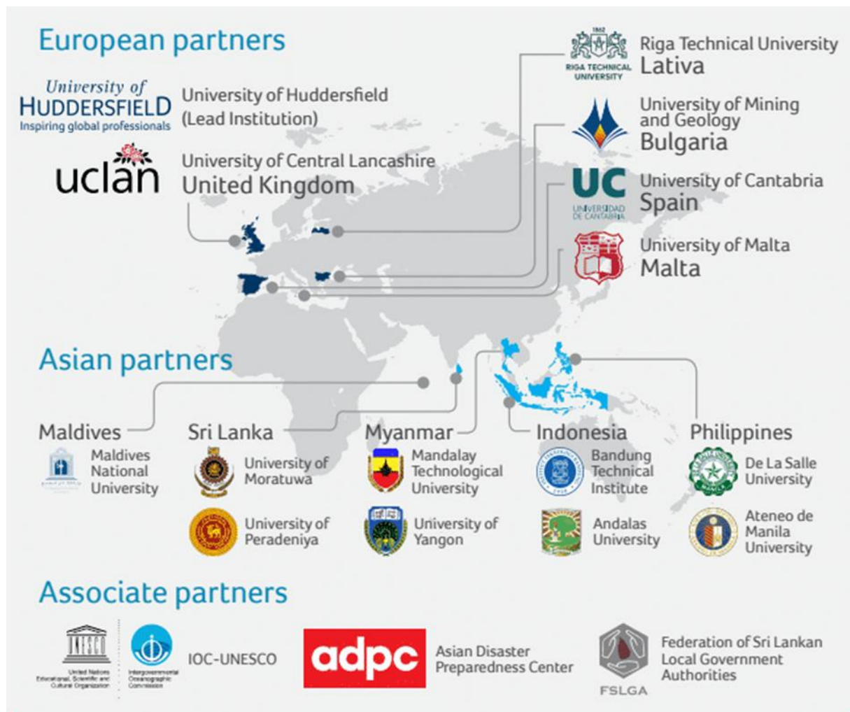
Fig.1. Partners and locations of the CABARET participants